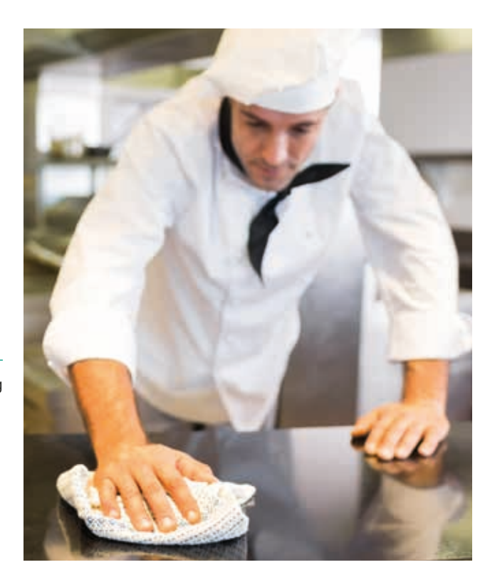
Level 2 Safer Food Handler Food Hygiene Certificate - Online

Course includes - the importance of HACCP based food safety management procedures, the preliminary processes for HACCP based procedures, how to develop HACCP based food safety management procedures, how to implement HACCP based food safety management procedures, how to evaluate HACCP based procedures.